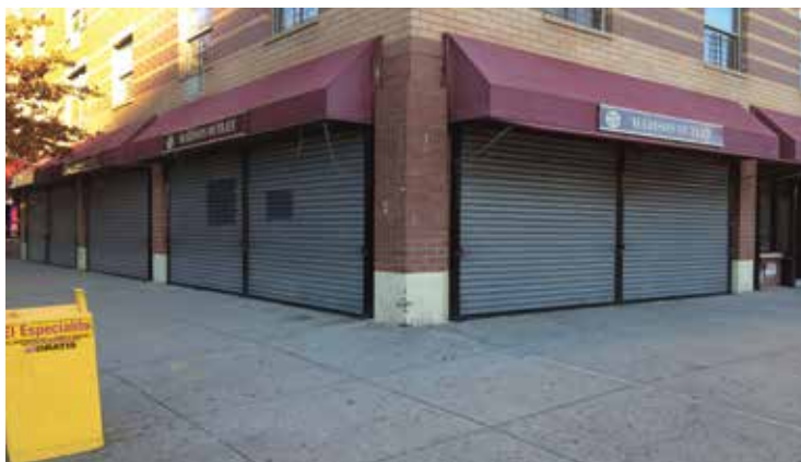
Corner view of our new location