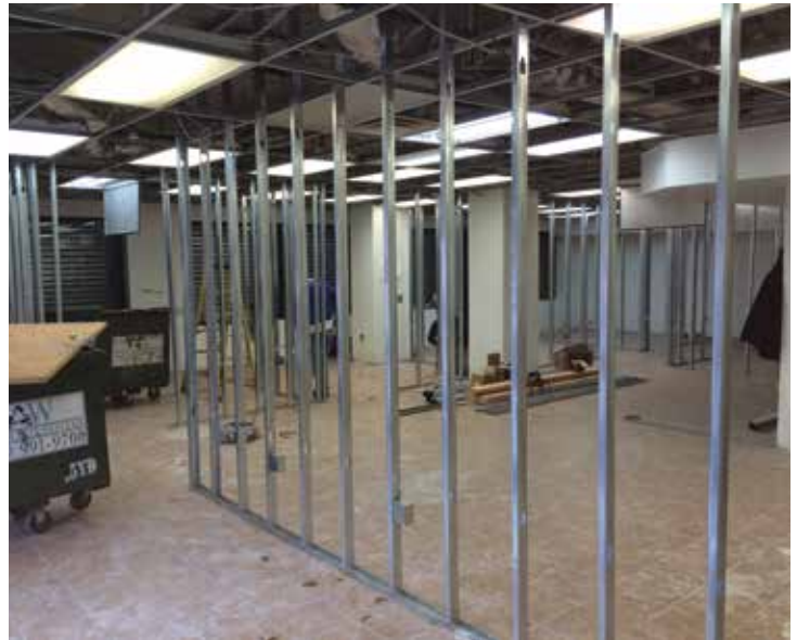
Under construction and coming soon!

Over the next three years we expect to significantly increase our staff and double program participation. That process is already underway thanks to the generous support of the Tiger and Pinkerton Foundations. But we still have a long way to go to reach our funding goals. So far, we have raised $175,000 of the projected $300,000 we will need to complete our renovations and support our new staff. We know that every dollar invested in our program yields tremendous benefits to justice-involved youth, as well as dramatic savings for tax payers.